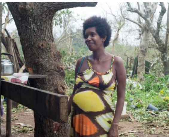
This expectant mother, now overdue, has no water, food, shelter or health-care.